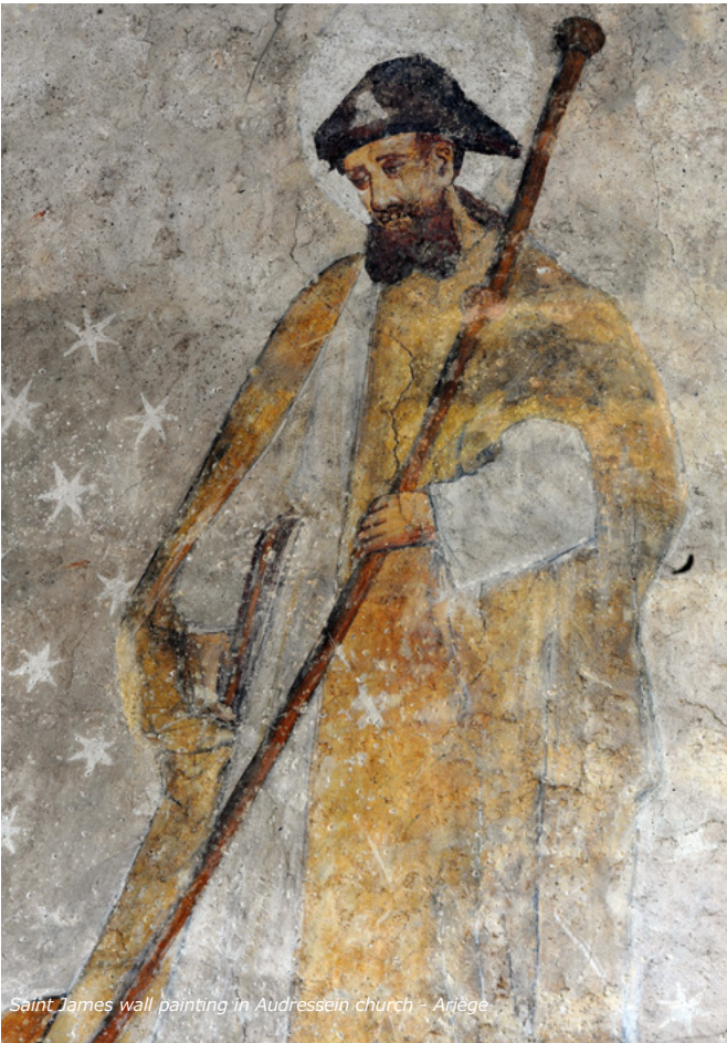
Saint James wall painting in Audressein church - Ariège

Tradition has it that after the Crucifixion, Saint James set off to evangelise Spain. After some years of preaching the gospel in the Iberian peninsula, he returned to Jerusalem. Arrested by the King of Judea, he was beheaded in about 44 AD, becoming one of the first Christian martyrs. It is said that his disciples put his body in a stone boat which an angel guided to the shores of Galicia, close to the present-day city of Santiago de Compostela.