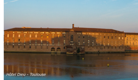
Hôtel Dieu - Toulouse

Several buildings are consecrated to the saints who evangelised the area in which they rest today, as St. James is believed to have evangelised Spain. These were visited by pilgrims - Hilaire in Poitiers (Vienne), Front in Périgueux, Avit in St. Avit-Sénieur (Dordogne), Seurin in Bordeaux, or Veronica, the legendary friend of the Virgin in Soulac (Gironde) with her husband, Amadour, to whom legend attributes the tomb which was miraculously discovered in 1166 in what is now the spectacular site of Rocamadour (Lot).