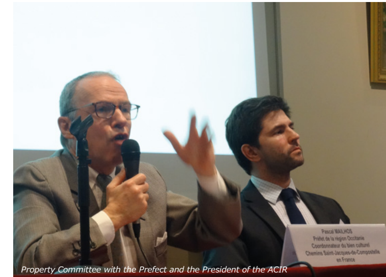
Property Committee with the Prefect and the President of the ACIR

A scientific council made up of historians, geographers, sociologists and qualified people brings its expertise to provide an inventory of the current state of research and knowledge ; it encourages the development and diffusion of knowledge.