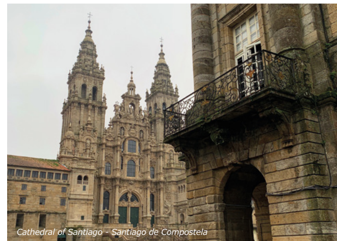
Cathedral of Santiago - Santiago de Compostela

These successive official recognitions thus cover the complete historic heritage of the pilgrimage in its entirety. They invite us to conserve it and to transmit it to future generations as a vector of cultural exchanges, meetings and dialogue; a source of inspiration and creation.