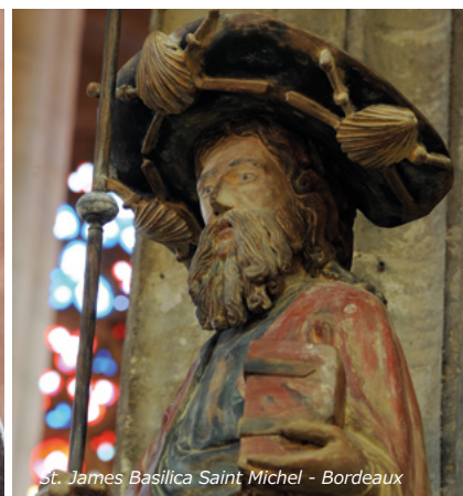
St. James Basilica Saint Michel - Bordeaux