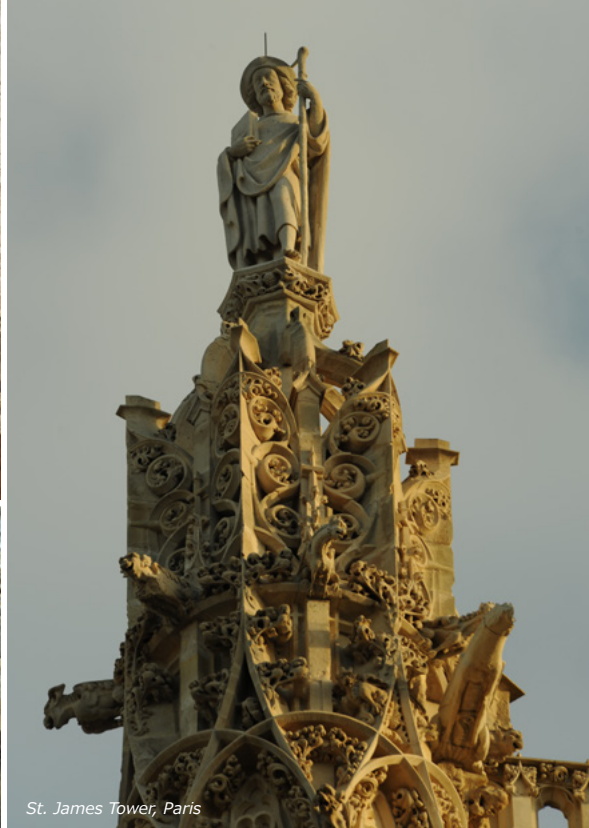
St. James Tower, Paris

Throughout the Middle Ages, Santiago de Compostela was a major destination for innumerable pilgrims from all over Europe. To reach Spain, pilgrims travelled through France. Four symbolic Ways starting from Paris, Vézelay, Le Puy and Arles and leading to the crossing of the Pyrenees resume the innumerable different itineraries followed by the travellers. Pilgrimage churches or simple sanctuaries, hospitals, bridges and wayside crosses line these routes, bearing witness to both the spiritual and material aspects of the pilgrimage. A spiritual exercise and a manifestation of faith, the pilgrimage also influenced the profane world by playing a decisive rôle in the birth and circulation of ideas and the arts.