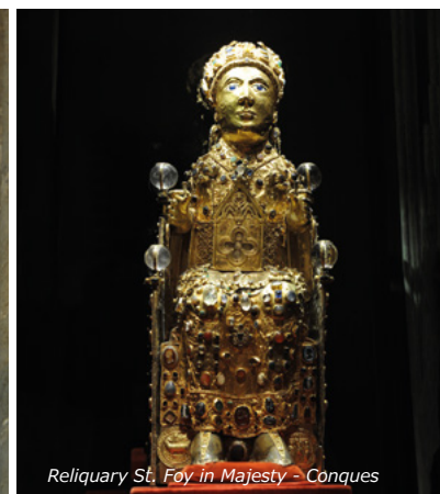
Reliquary St. Foy in Majesty - Conques