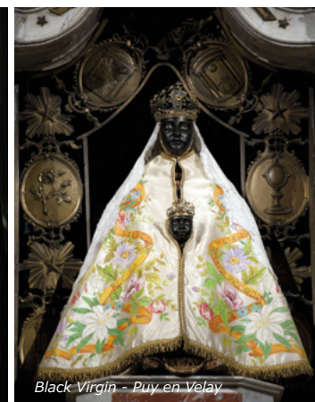
Black Virgin - Puy-en-Velay