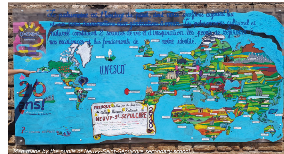
Map made by the pupils of Neuvy-Saint-Sépulchre secondary school

In a globalised, uncertain, not to say unstable, world, itinerancy along the St. James' Ways and the legacy of this heritage can serve the cause of intercultural dialogue, solidarity between peoples, education about threats to the environment or of the preservation of peace.