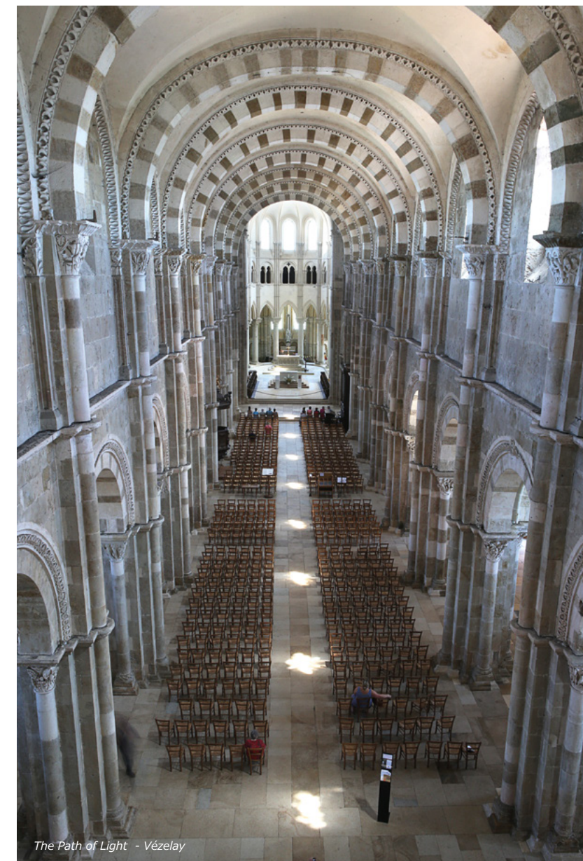
The Path of Light - Vézelay

In contrast to the Spanish cultural property, which is listed as «a continuous linear cultural landscape stretching from the Pyrenean passes to the town of Compostela», in other words the consecration of a