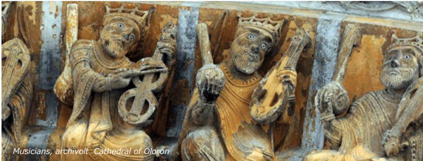
Musicians, archivolt - Cathedral of Oloron