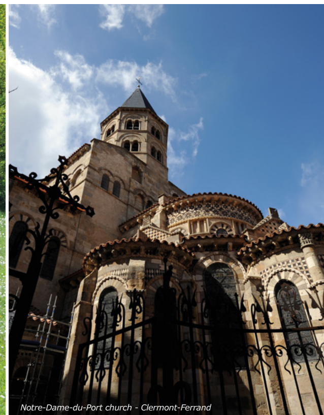
Notre-Dame-du-Port church - Clermont-Ferrand