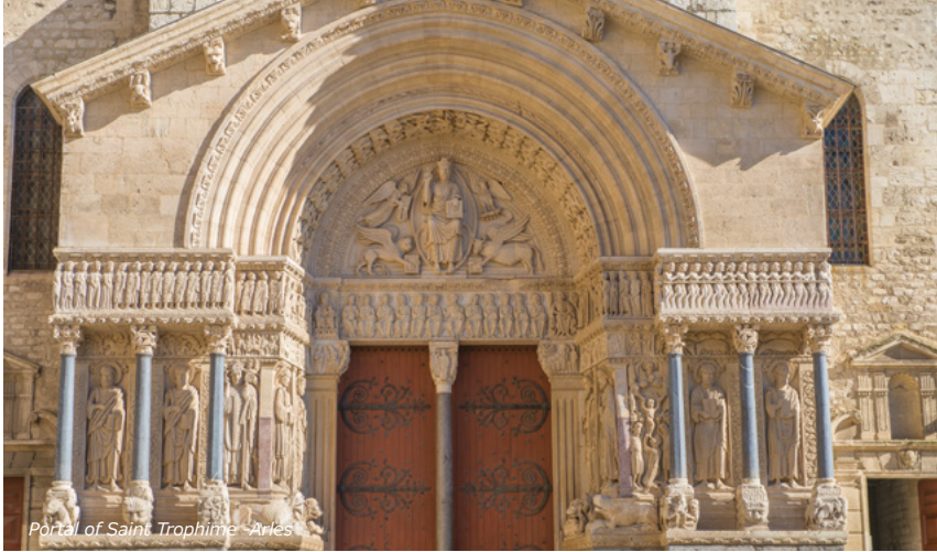
Portal of Saint Trophime - Arles