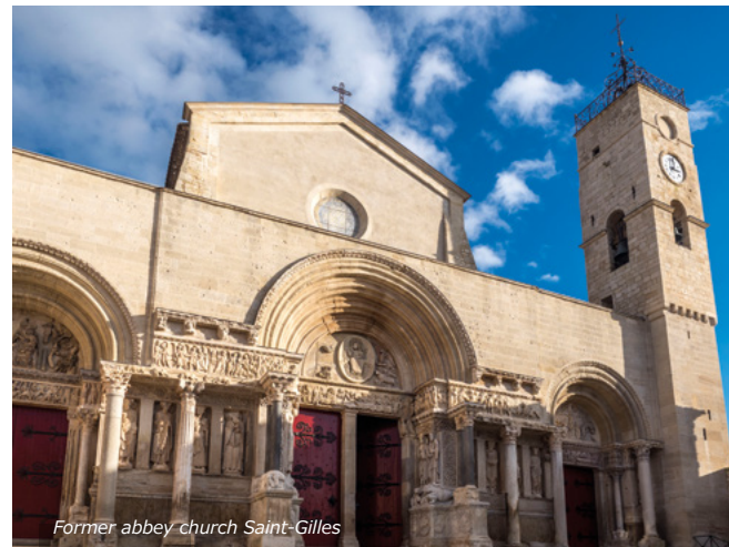
Former abbey church Saint-Gilles

Historians suggest the interpretation that by describing four symbolic « itineraries » (like the four cardinal points), the authors of the Codex showed that they were producing propaganda to promote the sanctuary. In the same way, they said that pilgrims were following in the footsteps of the Emperor Charlemagne. A few buildings evoke this legendary dimension hardly explained in the World Heritage listing. The « Guide for the Pilgrim » and the « Song of Roland » both locate the « Olifant » or Horn of Roland in the Basilica of Saint Seurin in Bordeaux, where Charlemagne supposedly deposited it. The knights killed in the battle are supposedly buried in the Alyscamps cemetery in Arles. The Abbey of Sorde (Landes) claims to have