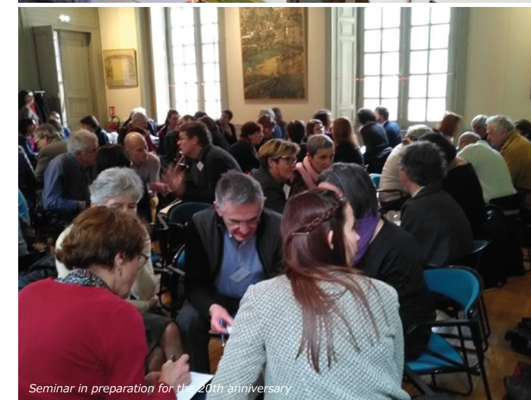
Seminar in preparation for the 20th anniversary