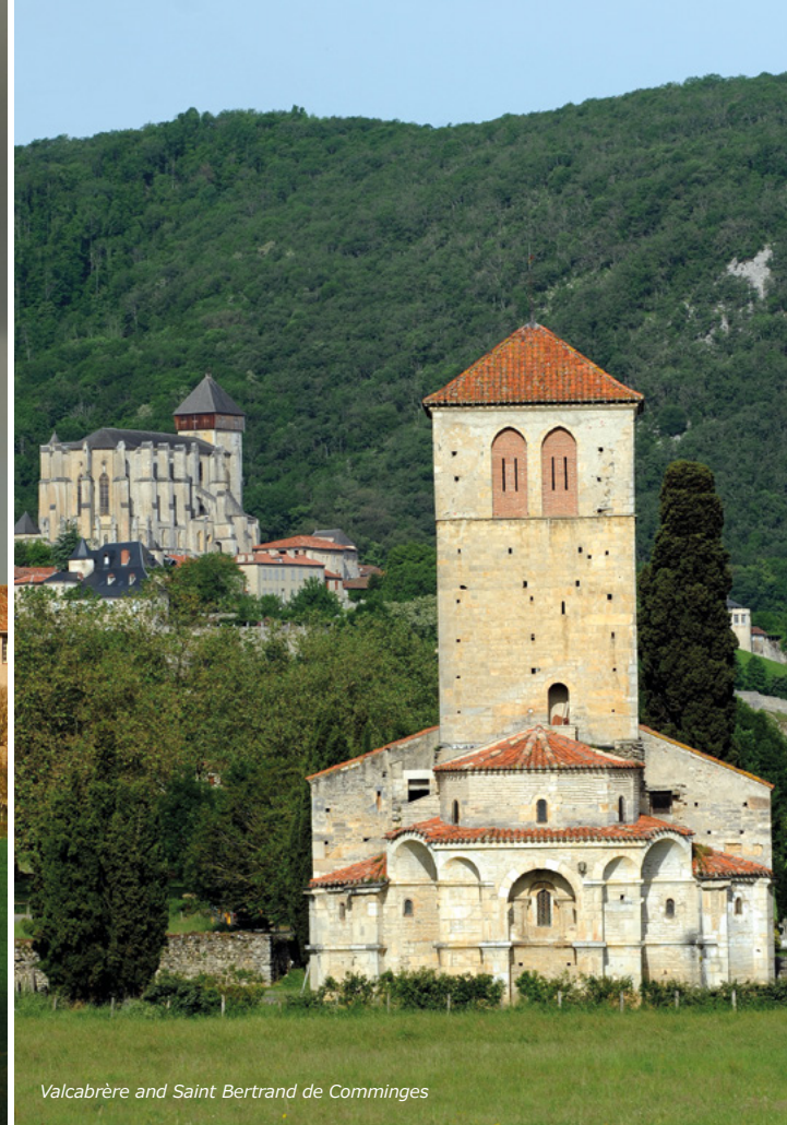
Valcabrère and Saint Bertrand de Comminges