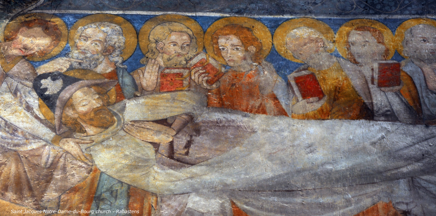
Saint Jacques Notre-Dame-du-Bourg church - Rabastens