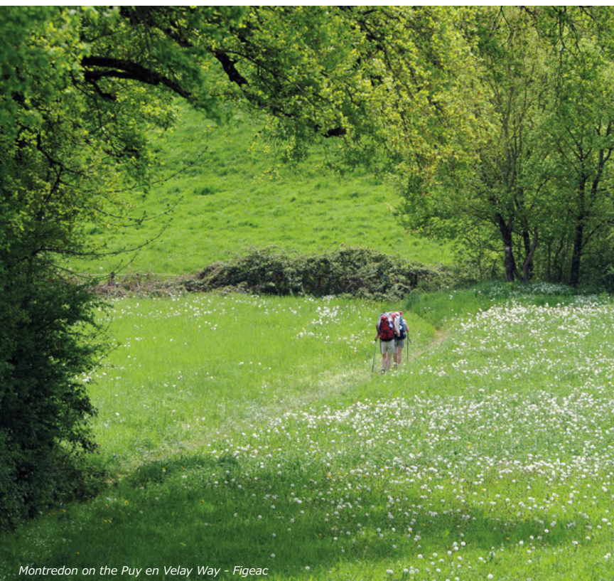
Montredon on the Puy en Velay Way - Figeac

* The UNESCO declaration of exceptional universal value : when a property is listed as World Heritage, the Committee adopts a declaration of exceptional universal value which constitutes the principal reference in the future for the protection and management of the property.