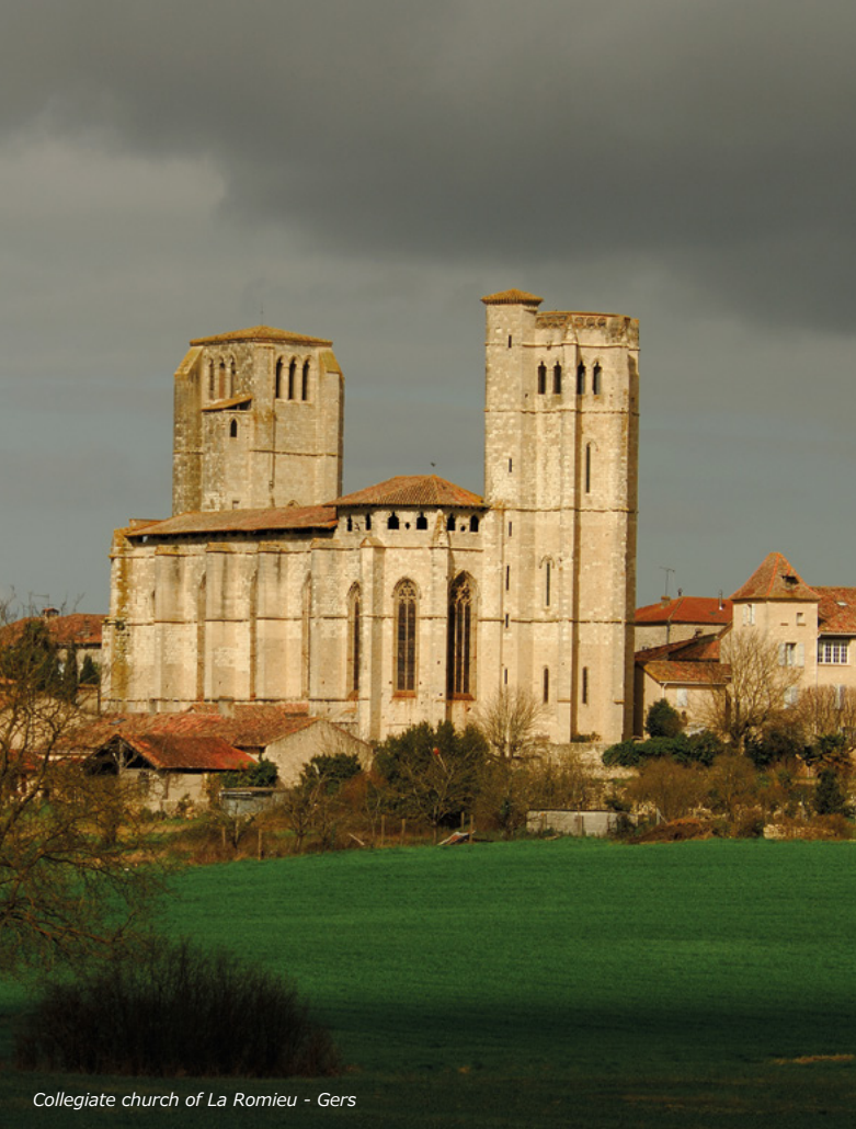
Collegiate church of La Romieu - Gers