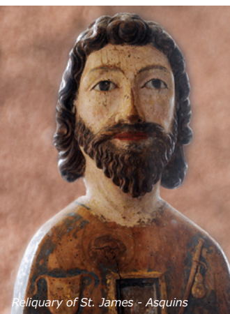
Reliquary of St. James - Asquins

The cults of water, earth or a myriad of gods were overlaid by Christianity with the cult of saints, intercessors between this world and the divine. Thus Quitterie, a young Visigoth princess, suffered martyrdom and was buried near a spring reputed to have miraculous properties. In Gréalou (Lot), the dolmen of Pech Laglaire was christianised by erecting a cross nearby.