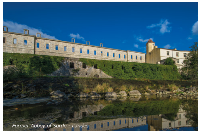
Former Abbey of Sorde - Landes

been founded by Charlemagne and the Basilica of Saint Sernin in Toulouse invoked the Emperor to justify its claim to the body of St. James, which he is supposed to have brought back from Galicia. Guilhem, his close companion, founded the abbey of Gellone in Saint Guilhem le Désert and became a hero of the «chansons de geste» (epic poems).